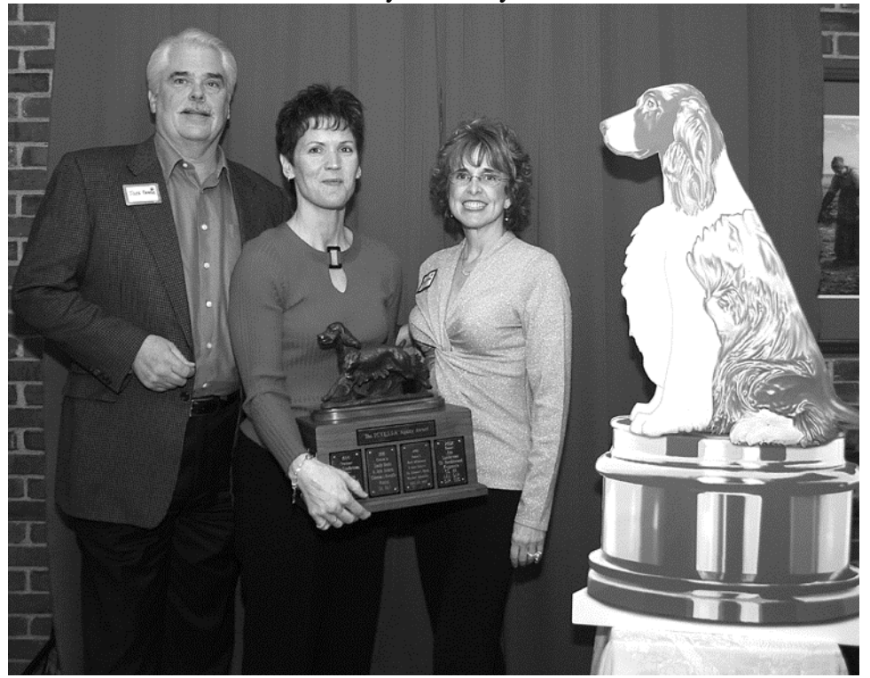
<u>TCVESSA Agility Award</u> CH/MACH Ramblewood Crystal Clear CDX SH WDX "Brooke" Owners: Tracy and Patty Salzwedel