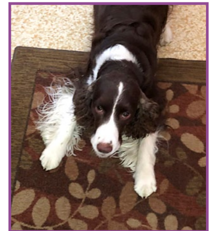
I'm ready for my warm-up stretch!

Prior to my passion for competitive dog performance (by the way, conformation IS a performance event) I was a physical education, health and biology major. I specialized in exercise physiology and athletic training. I competed in gymnastics and coached gymnastics at the com-